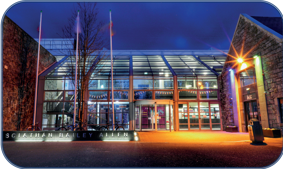
Entrance Aras na MacLeinn